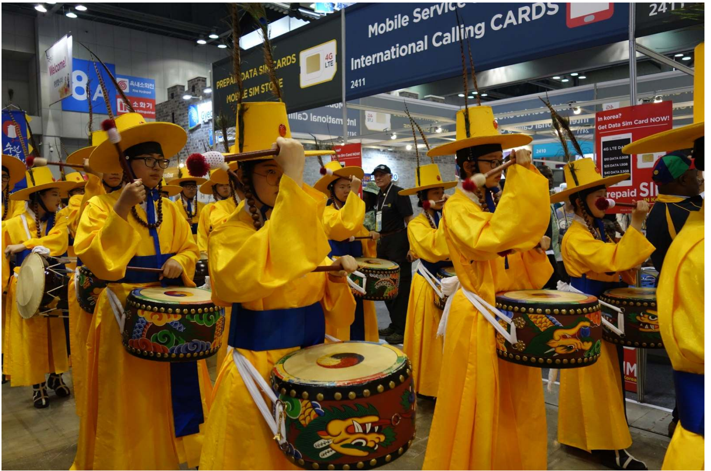
Korean band passing through the House of Friendship