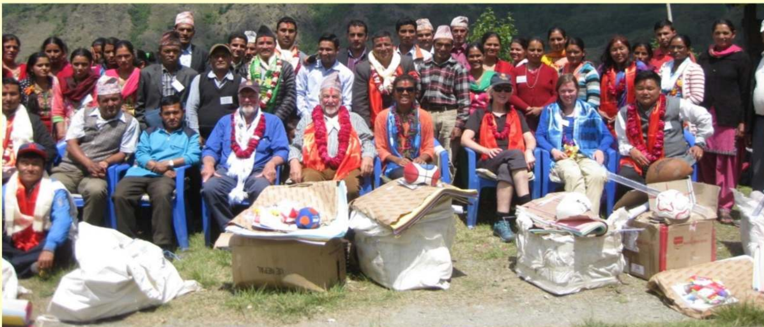
Presentation of teaching materials at closing ceremony of 10-day training course Ghara (Myagdi District) April 2015

Email us if your Club could be interested in supporting a project