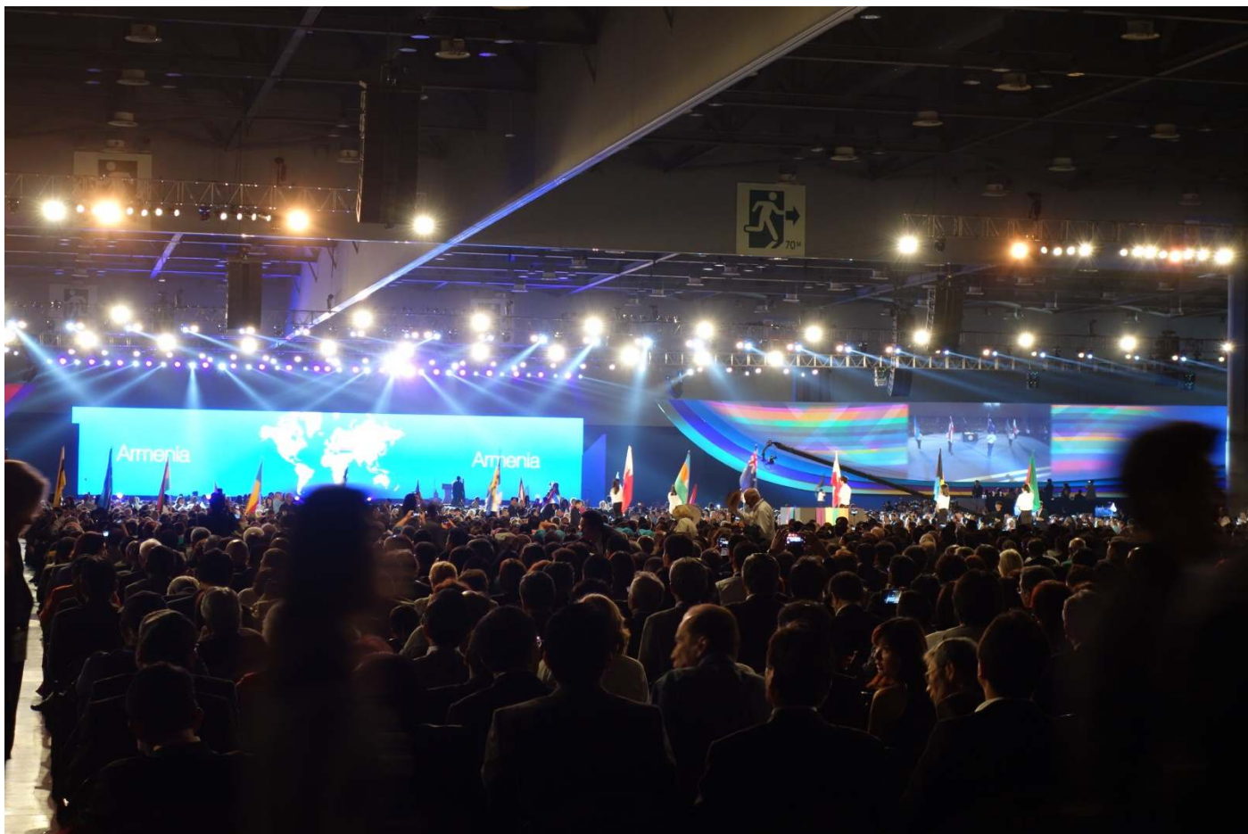
The Opening Plenary Session - the speaker at the podium barely visible in the distance