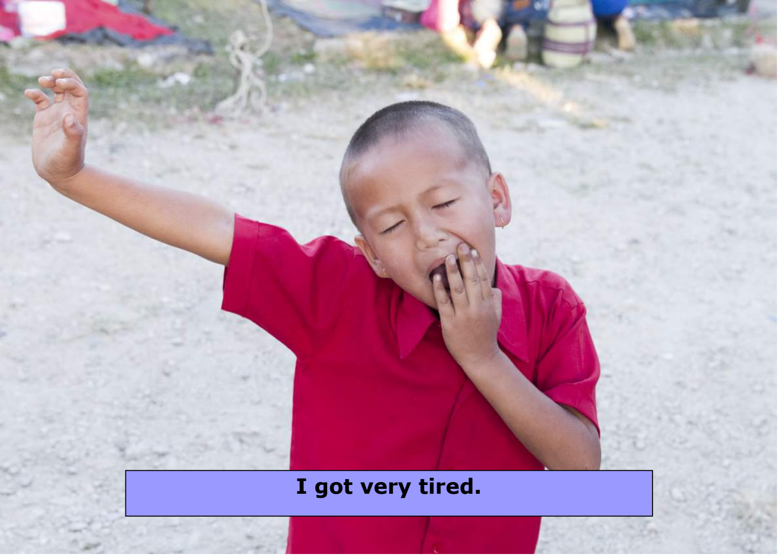
I got very tired.