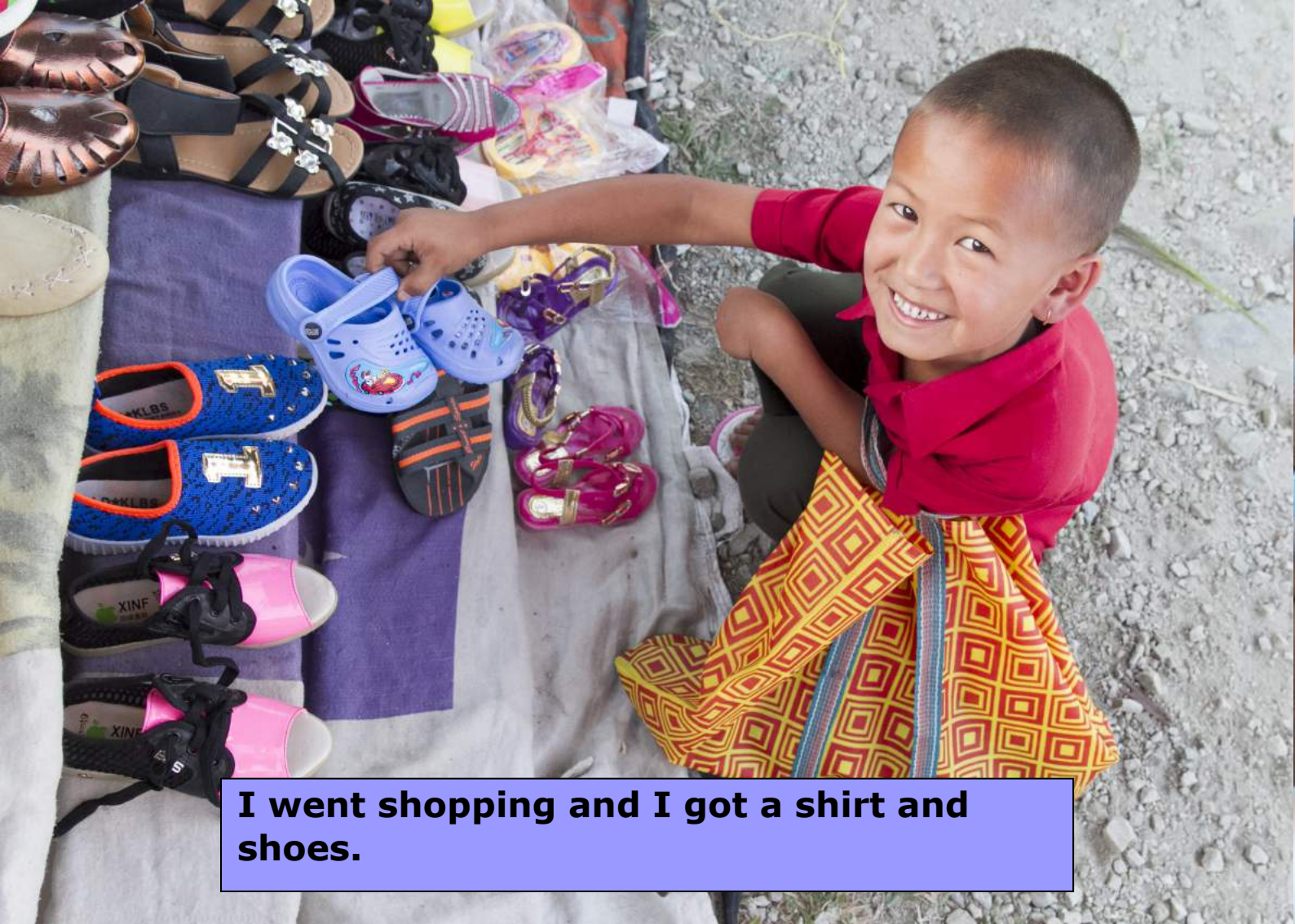
I went shopping and I got a shirt and shoes.