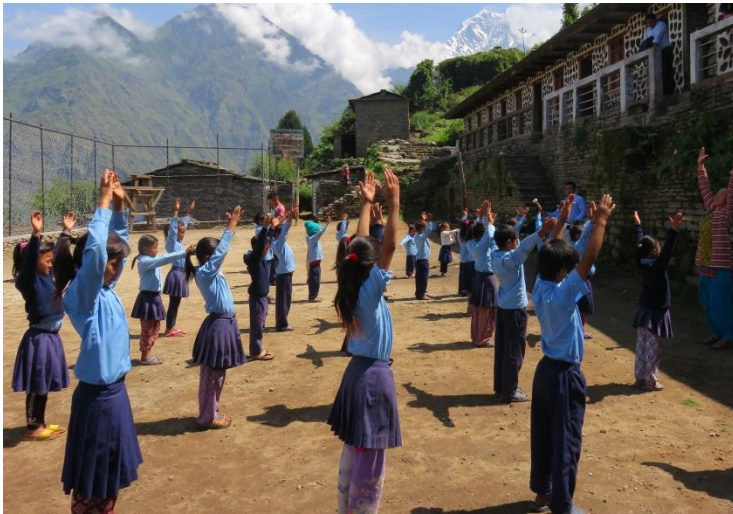
Assembly and exercise in the morning