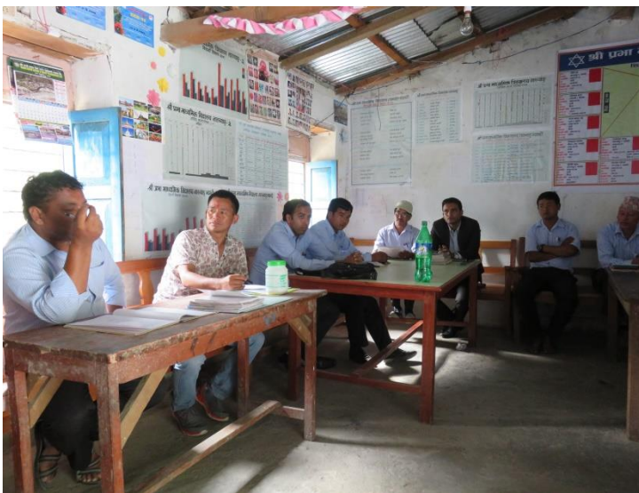
Meeting with the teacher staffs