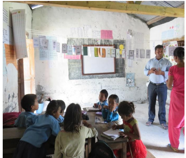
Live class room observation and feedback