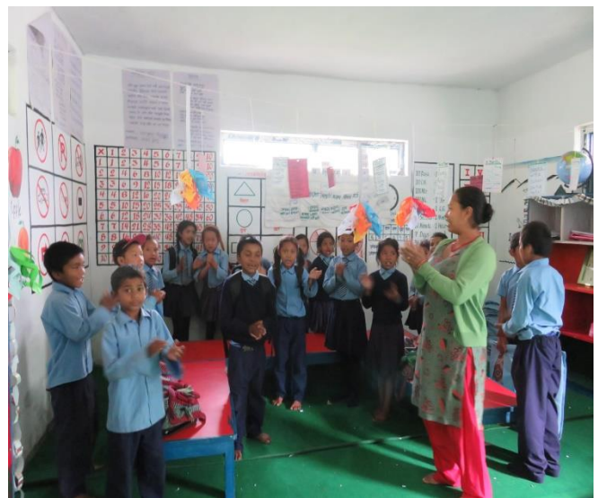
Enjoying children in chanting